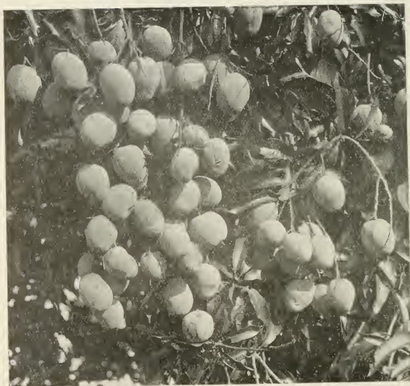
SHOWING THE FRUITING HABITS OF THE MANGA AMARILLA TYPE. SANTIAGO DE LAS VEGAS.